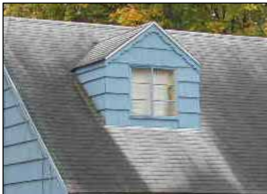
Extensive algae growth.